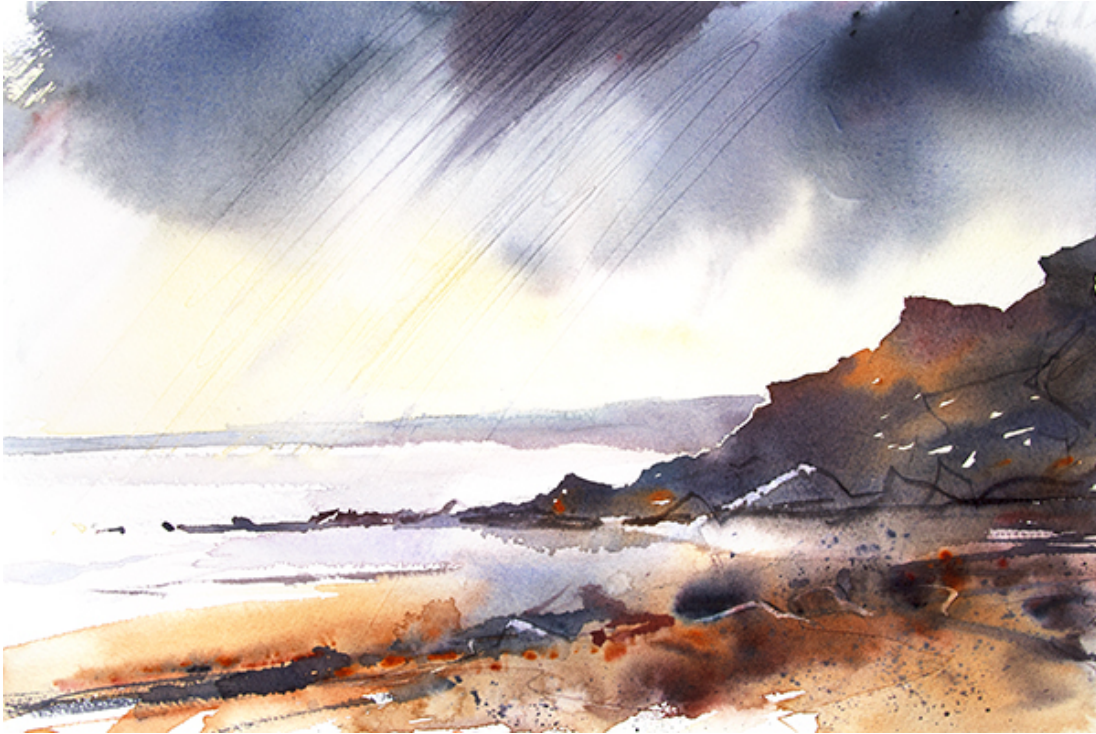
Seascape with Rocks

You can find a video link to my demonstrations from week 3 below. Please note the video demonstration uses a mixture of Hake and round goat haired brushes, however the principle of creating contrasts of dark and light shapes across the surface of the paper remains the same.